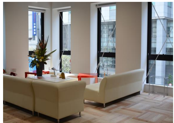
Office exterior and interior