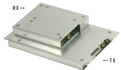
Nishi RF Lab's Transmitter / Receiver